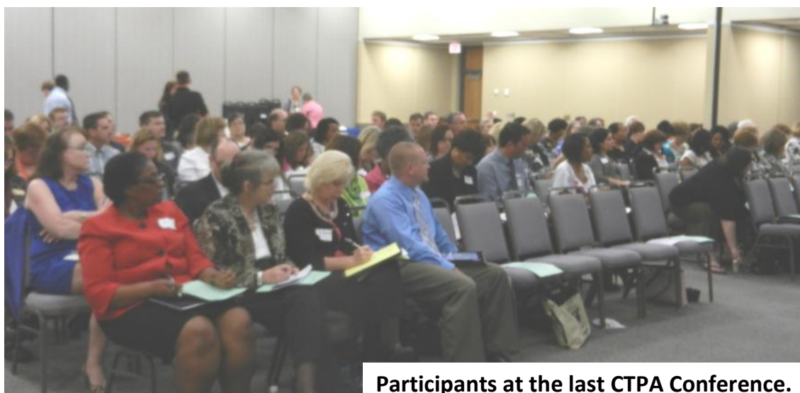
Participants at the last CTPA Conference.